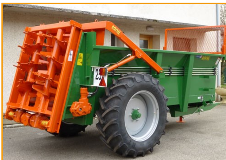
E 40 hydraulic door option